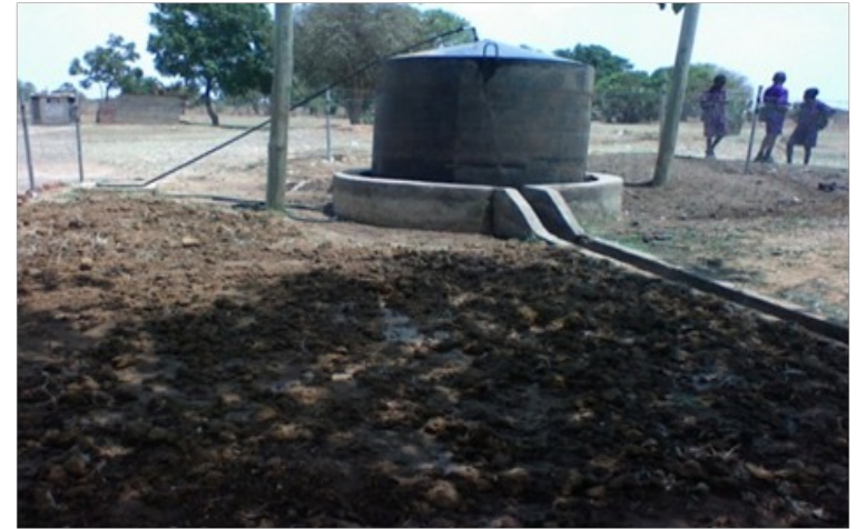
Charged Biogas Digester producing methane gas