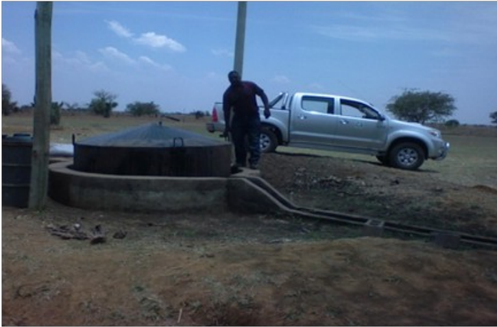
Uncharged Biogas Digester

Science, Technology and Innovation: Biogas Technology an Innovative Energy Source - the Driver of Sustainable Livelihoods