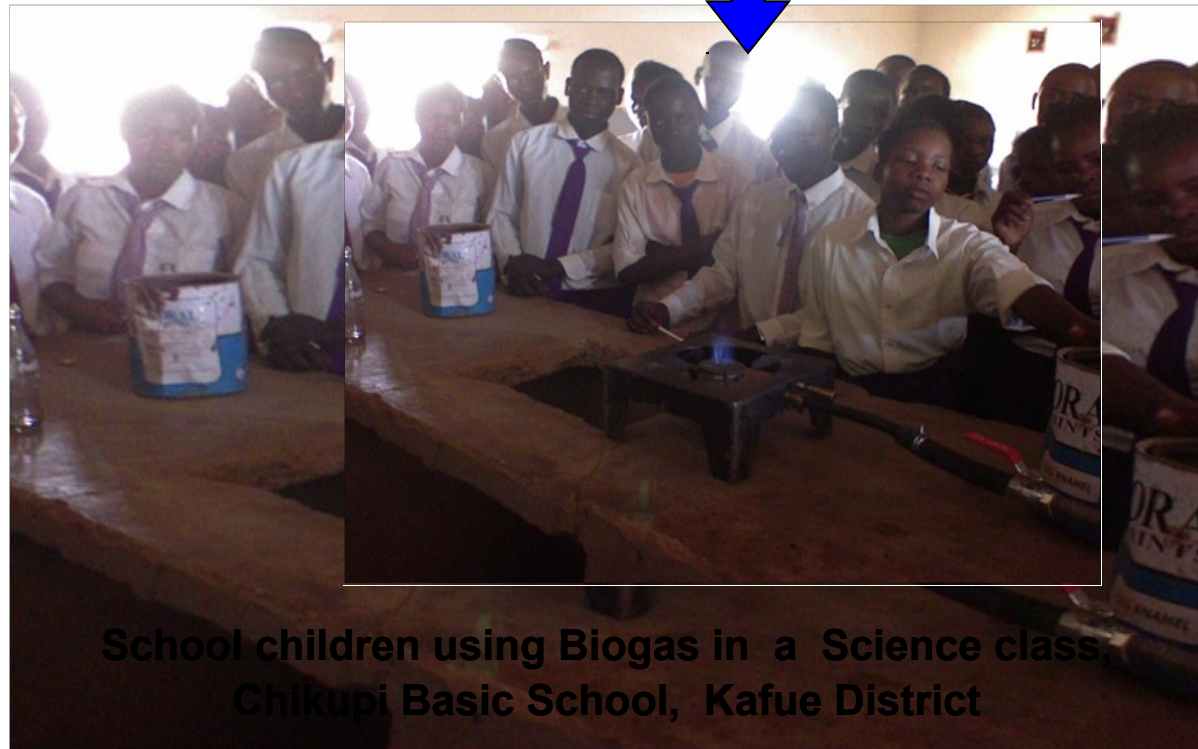
School children using Biogas in a Science class, Chikupi Basic School, Kafue District